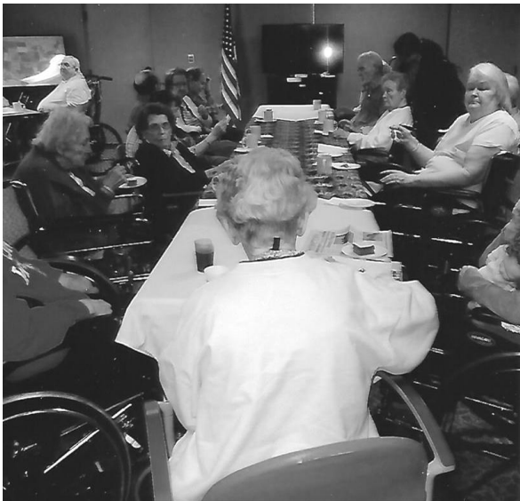
The residents loved the pumpkin bars!